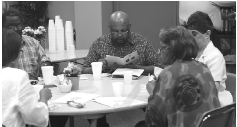
Members of CBF partner church, Zion Hill Missionary Baptist Church, Camden enjoy breakfast and prepare to attend the breakout sessions.