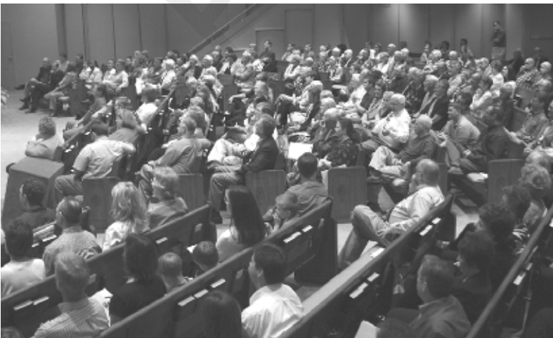
Participants at the Spring Conference