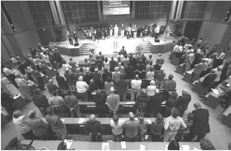
Spring Conference worship at Second Baptist Little Rock.